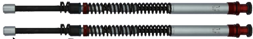
2 JRi Harley Fork Cartridges